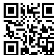
MOC QR Code Session IV